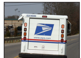
Post Office Discovers Innovative New Way to Send Mail Via Internet