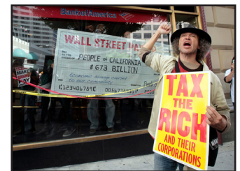
Same Five People Still Protesting Everything