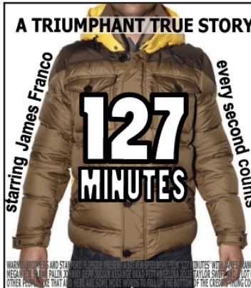
Movie poster for 127 Minutes.