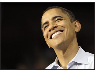
Birthers Who Meet Obama in Person Want Better Evidence that it Was Actually Obama

New Online-Only Content Every Day at stanfordflipside.com!