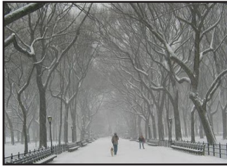
NYC Celebrates the Whitest Kwanzaa in Decades