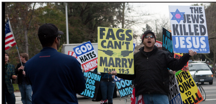
One of the many protesters protesting the counter-protest

STANFORD, CA-- News that the infamous Westboro Baptist Church (WBC) would be protesting at Stanford's Hillel House divided much of the student body.