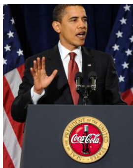
Budget cuts have caused corporate sponsorship and product placement in this years Coca-Cola State of the Union address.

Fellow citizens, what we need now is to act, and I ask you, members of Congress, is it in you? Do you have what it takes to keep this nation strong? We've been fighting for the health care bill, and bickering has led us nowhere. Members of Congress, no matter what