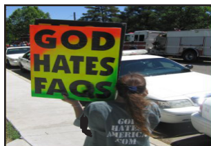
God Hates Faqs Protest Against Computer Illiteracy