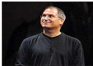
Steve Jobs: "I just saved a bunch of money on my car insurance by switching to Geico"