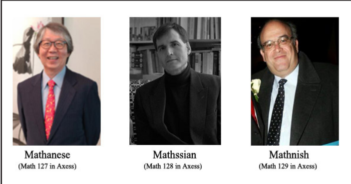
Mathanese (Math 127 in Axxess)

SUBJECT COMBINES THE STUDY OF MATH WITH FOREIGN LANGUAGE