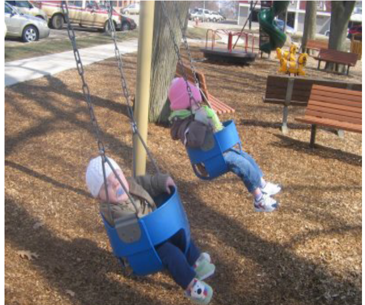
Two toddlers of the same-sex in a swing marriage

Same-sex swing marriages still do occur, to the disdain of the state. Those same-sex couples who want to get swing-married are still able to, but they are not recognized officially under state law. There are still rogue teachers who will recognize a same-sex swing marriage, but definitely not on the public school playground.