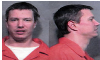
Inmate #36788

After this announcement, the prison underground