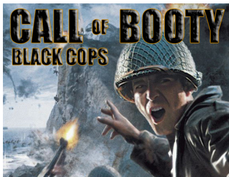
Cover for the new Call of Booty game. This soldier is about to find massive booty.

Call of Booty: Black Cops is a first-person shooter with stealth and tactical play aspects that puts players in the role of an African-American cop looking to have sex with a large variety of women. Created with the input of actual black cops, the game mixes traditional Call of Booty tactical gameplay with new gameplay options designed to expand the players' experience.