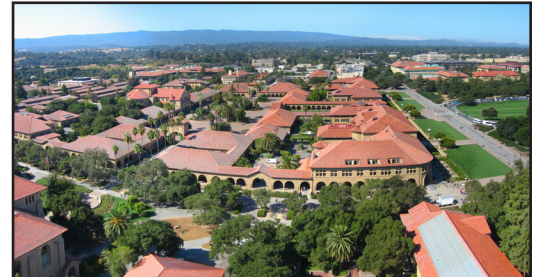
Aerial shot of the campus many will not attend.

Continuing the trend of recent years, planners created a slogan printed on a banner to greet the rejects as they enter the University and repeated often throughout the weekend. The Reject Class of 2014 is hailed with You might try and get in for grad school, but we probably won't take you then either , continuing the theme of 2013's Zebbras don't change their stripes and 2012's You will never be good enough .