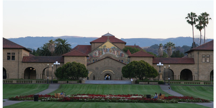
A BEAUTIFUL IMAGE OF A SCHOOL THAT TENS OF THOUSANDS WILL NOT BE ATTENDING.