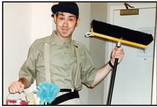
Janitor Fired For Charging Phone, Also For Being Bad Janitor