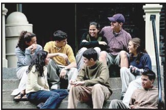
Student Joins Inside Joke Making Club, Doesn't Get It