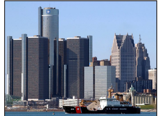
The Detroit skyline may have to turn to rubble if there is any chance of the city gaining real sympathy.

The actual methods of producing a gigantic tremor beneath Detroit initially stumped administrators, but they are now closing in on a plan. “We’re thinking of telling the Big Three automakers to build a giant, golden hammer to smack the ground with. It’s