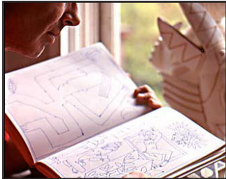
Sketch Artist Ends Duel in a Draw