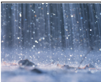
Rain: Revolutionizing Awkward Small Talk Between Stanford Students