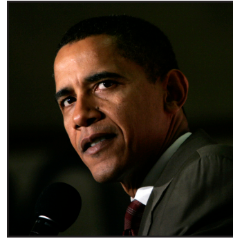
Obama takes on the tough issues.

"But I'm here to tell you today, from one American to another, that we have heard your voices,