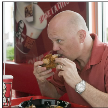
White person at KFC on MLK day

Some white people walking by the KFC scowled. Said one passerby, "It's just not very sensitive to African Americans on Martin Luther King Day for us to enjoy fried chicken, especially since it started as a meal for slaves that could be prepared cheaply while disguising the taste of old meat."