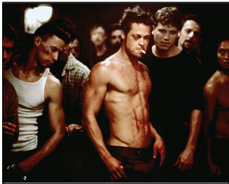
Fight Club Totally Beats the Shit Out of Nonviolence Club