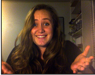
Girl Who Could Have Had Her Cake and Eaten It Too Unfortunately on Atkins Diet