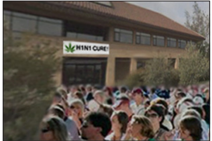
Anxious Stanford students await emergency marijuana in hope to stop H1N1.