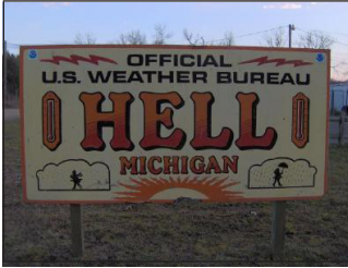
Hell, Michigan Freezes Over

For in-depth analysis visit www.stanfordflipside.com